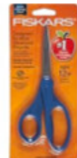
7 Inch Scissors