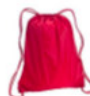
PE: *Drawstring Cinch Sack *Shirt