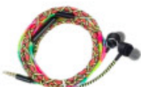
Earbuds or Headphones