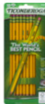
No. 2 Pencils or Mechanical