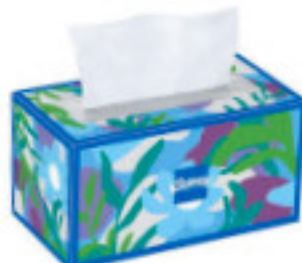
3 Boxes Kleenex