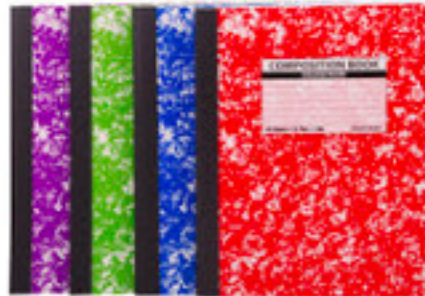
4 Wide-Ruled Composition Notebooks