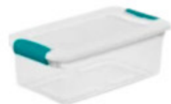
1 Plastic Storage Container with Lid (Shoebox Size)