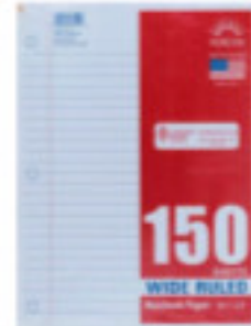
One Wide Ruled Notebook Paper