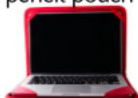
Optional: Protective Chromebook Case