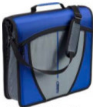
One 2-3 inch Zipper Binder