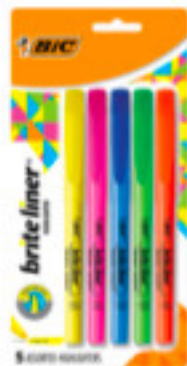
Highlighters(Yellow, Green, Pink, Orange, & Blue)