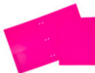
One three-hole punched two pocket folder