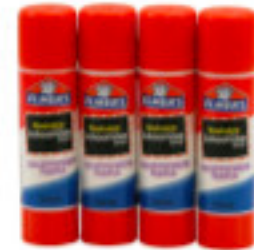
4 Large or 8 Small Glue Sticks