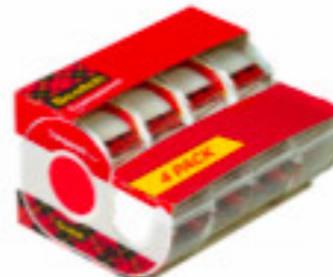
4 Rolls Scotch Tape