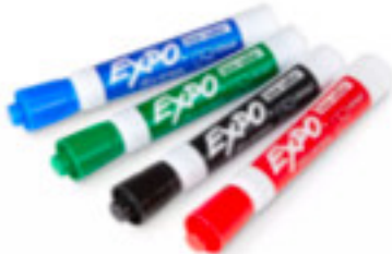
2 Dry Erase Markers