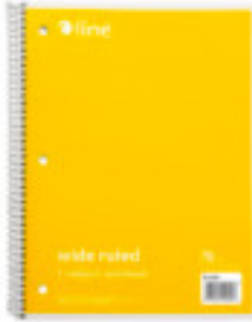
1 Wide-Ruled Spiral Notebook