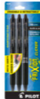
Black Erasable Pens